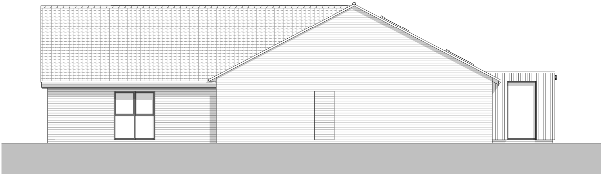
South Elevation as Proposed 1 : 100