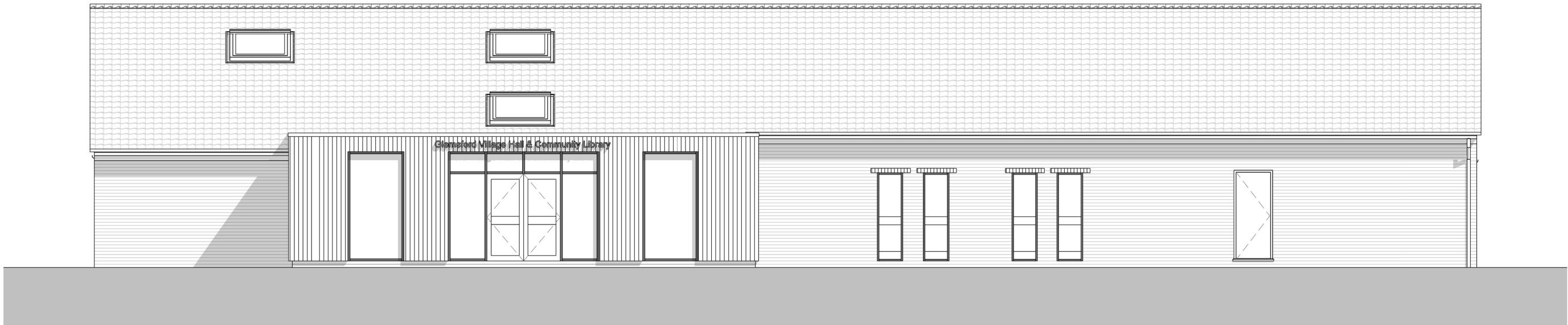
East Elevation as Proposed 1 : 100