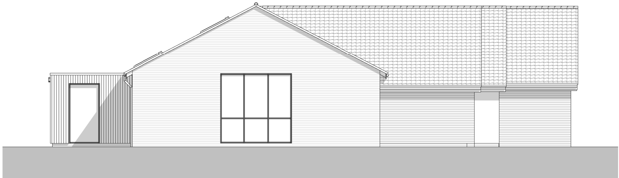
North Elevation as Proposed 1 : 100